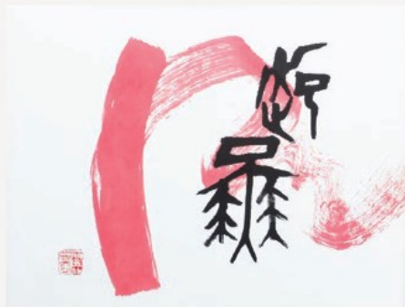
起舞 Dance Gracefully 63.5 x 53cm