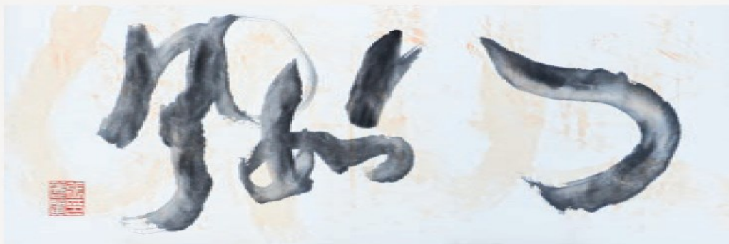
行如风 Swiftness 122 x 54cm