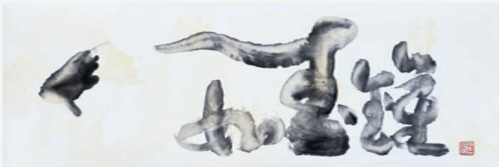
坐如钟 Unswerving 122 x 54cm