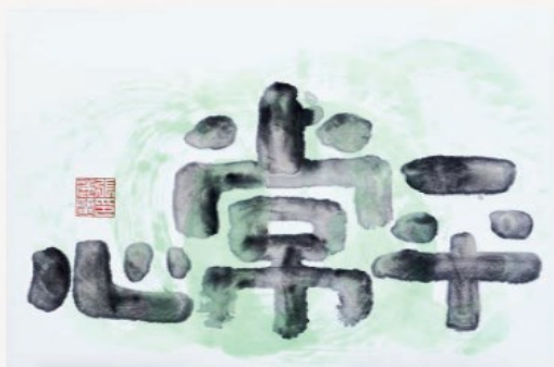
平常心 Unruffled 89 x 63.5cm