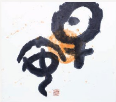
早安 Good Morning 71 x 65.5cm