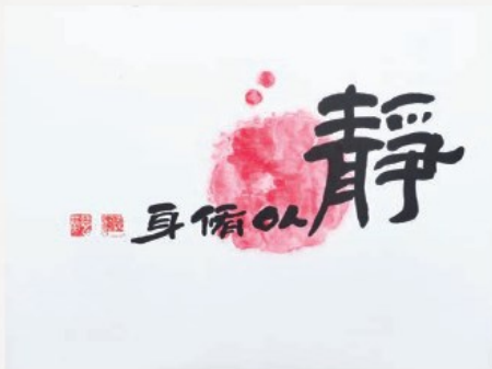
静以修身 Reflections 63.5 x 53cm